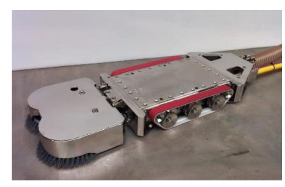
Under water vacuum cleaner

iv. Space test centres: RAL, Centre spatial de Liège, ESTEC (ESA)